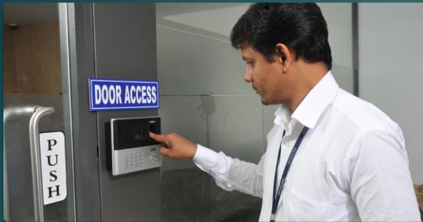
Biometric fingerprint access