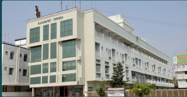
Ganapathy, Coimbatore Tamil Nadu, India