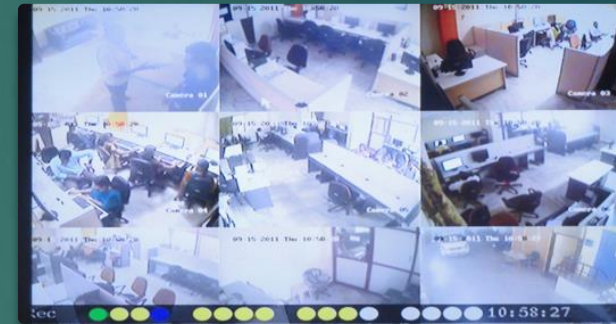
CCTV monitoring (365 days)