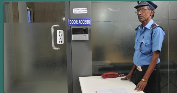
24/7 security guards