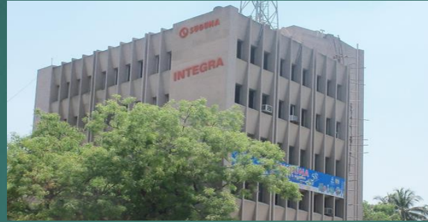
Avinashi Road, Coimbatore Tamil Nadu, India