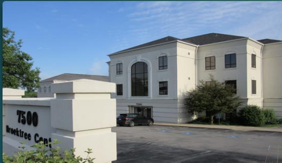
Pittsburgh, Pennsylvania USA