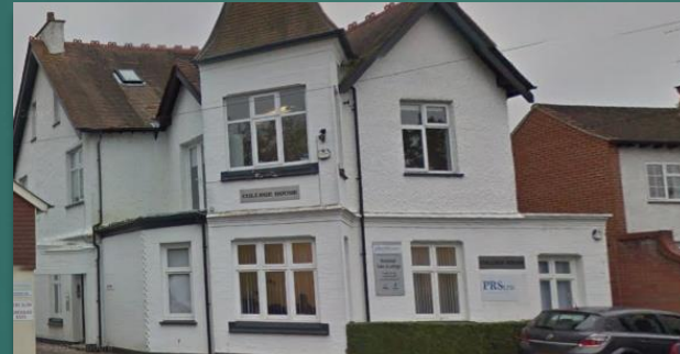
Ruislip, London UK