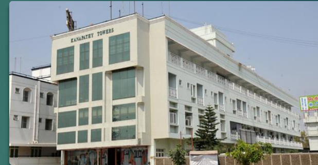
Coimbatore, Tamilnadu India